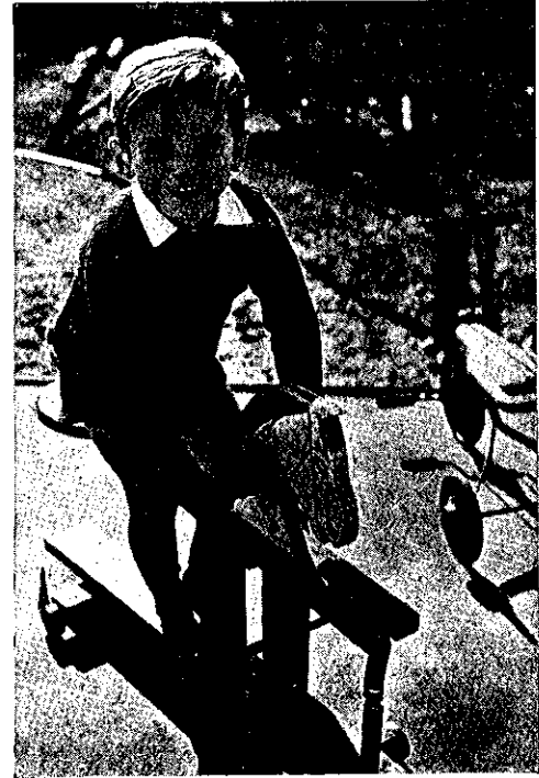
One of our bonny bright boys.

"I was particularly impressed with the way the children have been trained, and I think the Home a credit to the Matron and Sister, who are lovely Christians. The children look the picture of health, and I can see they are well cared for and well fed. God continue to bless you and your Society for caring for the less fortunate people of our land."