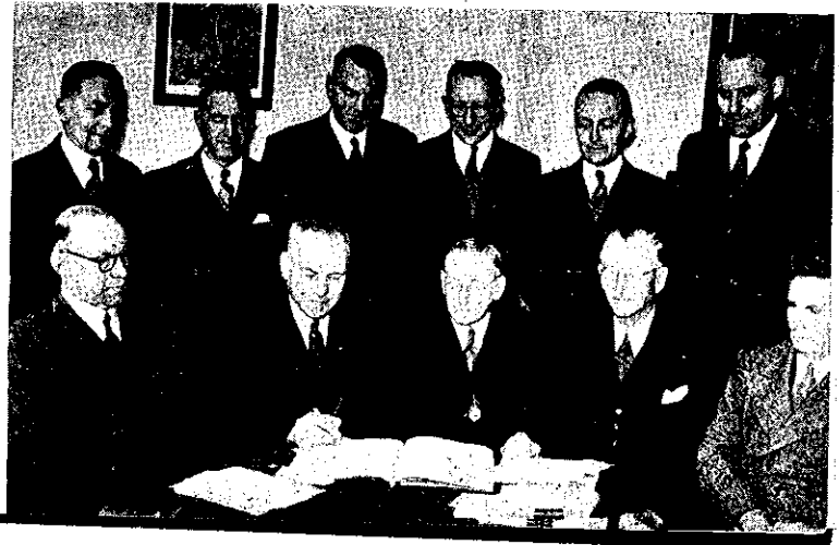
Members of the Board of Management.